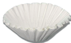
BRU FILTER PAPERS - CASE OF 1000 8000200