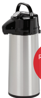
AIRPOT 2.2L 1700179